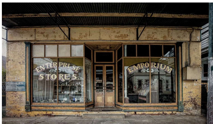
Pam Rixon “Emporium is Closed”