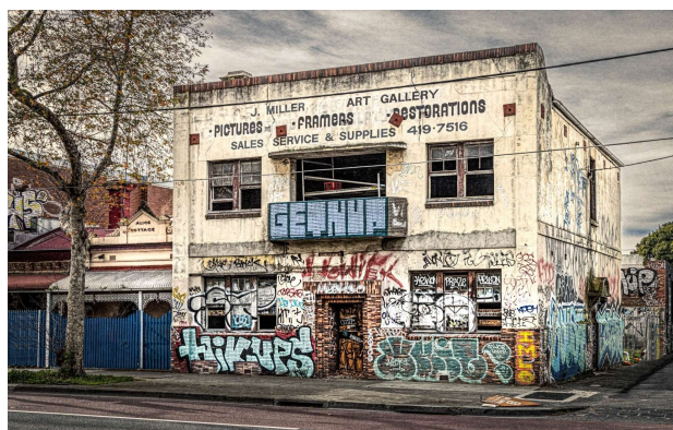
Pam Rixon “Gallery Of Decay”