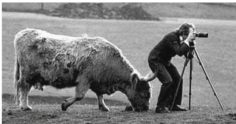
Funny Quotes/images taken by photographers!!

VAPS and VAPS Newsbrief - http://www.vaps.org.au/