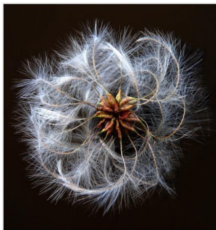
“Seed Pod” – Val Armstrong