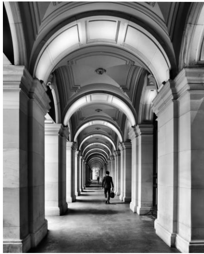
“Through the Arches” – Pam Rixon