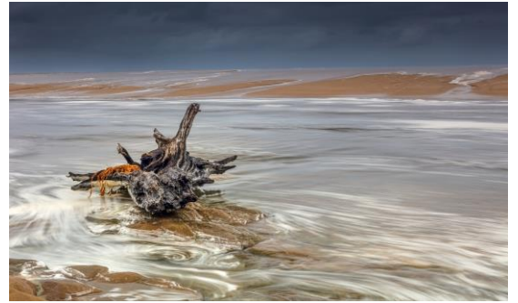
“Driftwood” – Pam Rixon