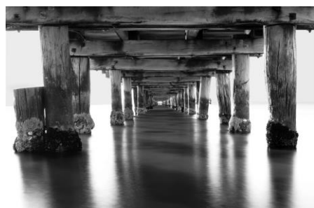
“Down Under the Old Pier” – Bill Chan