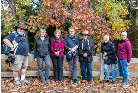
The Team on the Emerald Outing

There will be a follow up Zoom Meeting Thursday 26 th May 7.30 pm, to review images and editing processes. All members are welcome to attend.