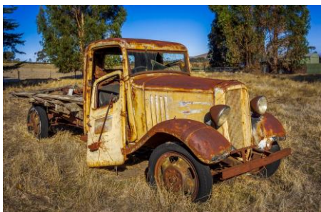
“Vintage Ute” – Ean Caldwell