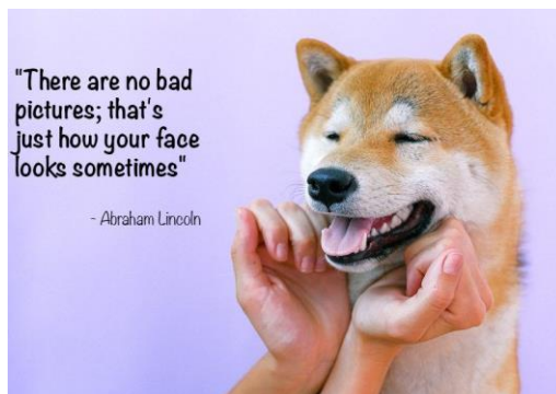
Funny Quotes/images taken by photographers!!

VAPS and VAPS Newsbrief - http://www.vaps.org.au/