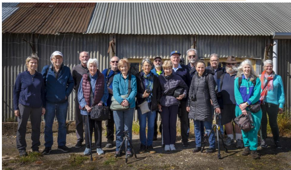
Group Photo of those present at the Murtoa weekend. Taken outside the stick shed.