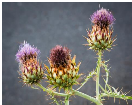
“Three of a Kind” – Liz Reen