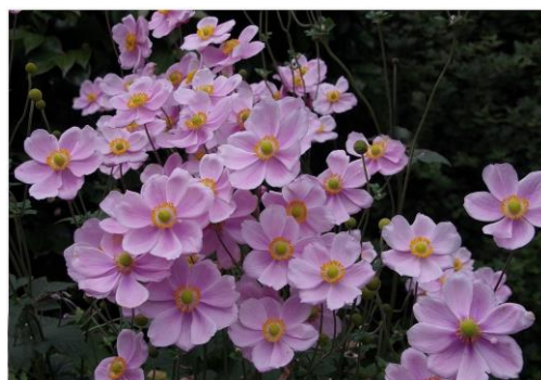
“2208 Blossom Time” – Les Armstrong