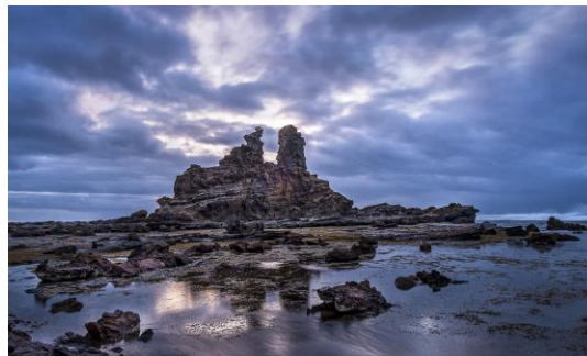
Eagles Nest