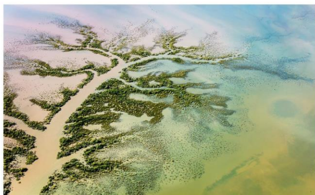
Kimberley Mangrove Patterns