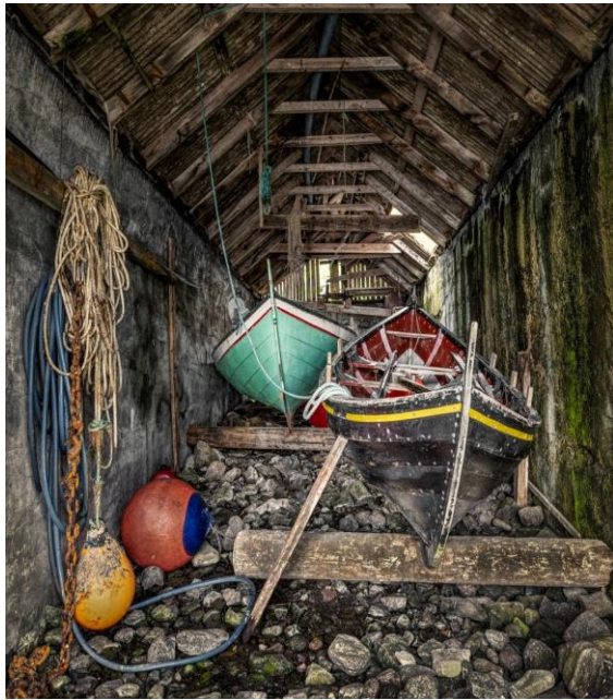
Pam Rixon – Old Boatshed