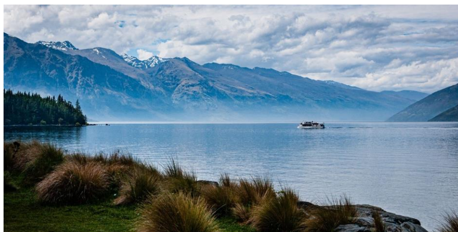
Liz Reen “Morning Mist Lake Wakatipu”