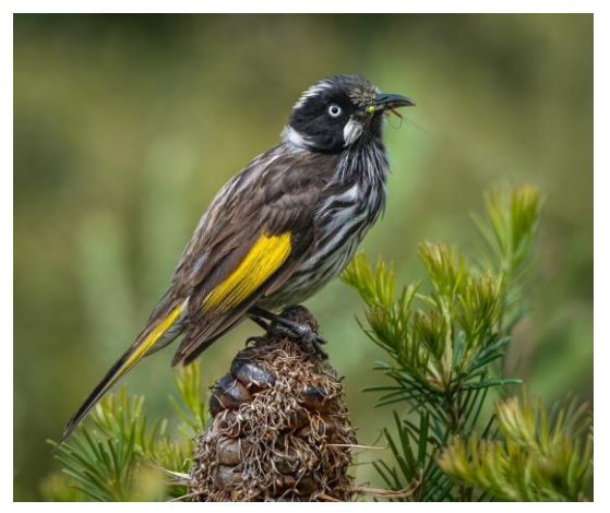
Pam Rixon "New Holland honey Eater"