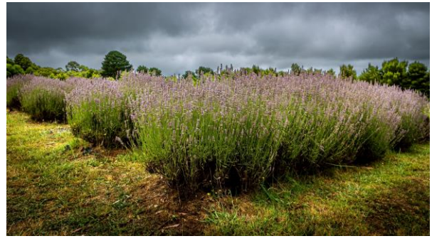
Cov Douvitsas "Lavender Farm"