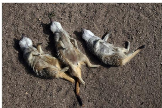
“Sunbaking” – Les Armstrong