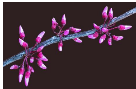
“Forest Pansy” – Ean Caldwell