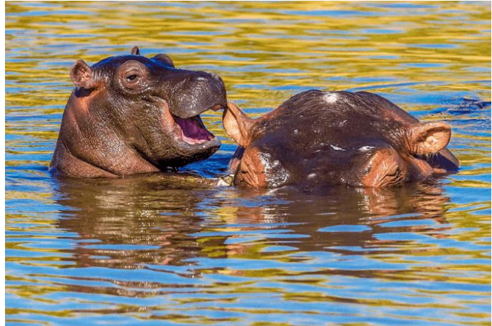
“Whispering Sweet Nothings”