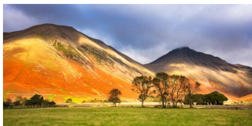
“Colours of Wasdale” – Pam Rixon