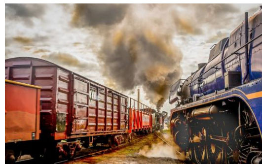
“Converging Trains” – Con Douvitsas