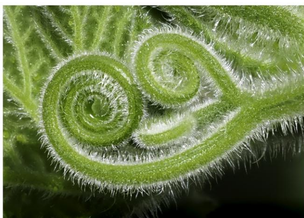
Happy in the Veggie Patch - Ros Osborne