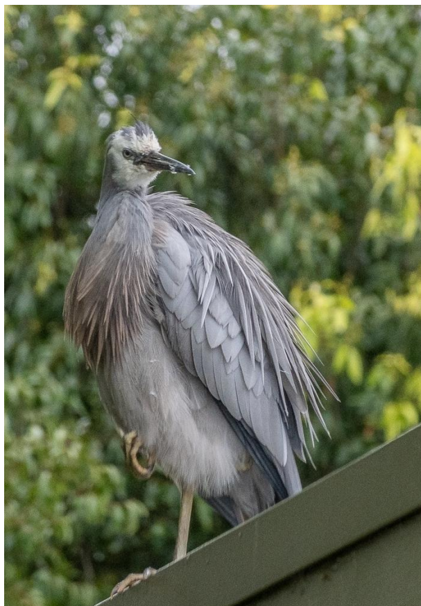
Ruffed Heron