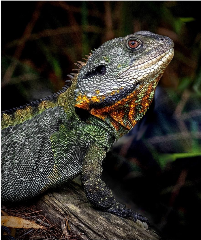
Water Dragon