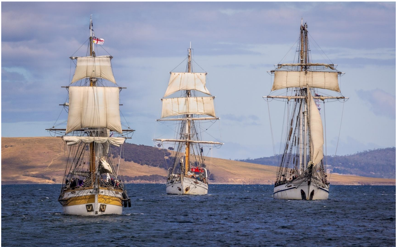
Tall Ships in the Derwent ~ Pam Rixon