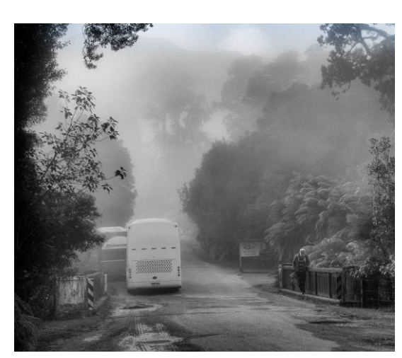
"Bus & Fog"