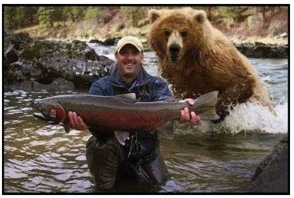
Opps – Watch Out for the Bear!!