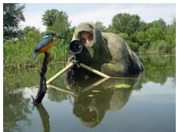
Some People Go to Extrodinmary Lengths to get the Shot!!