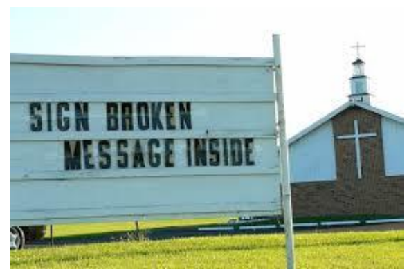
The Sign says it All!!