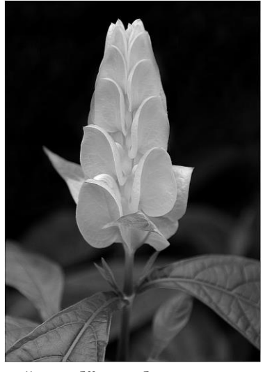
"Regal" – Val Armstrong