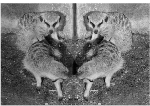
"Seeing Double" - Les Armstrong