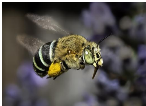
Homeward Bound - Ros Osborne. SP