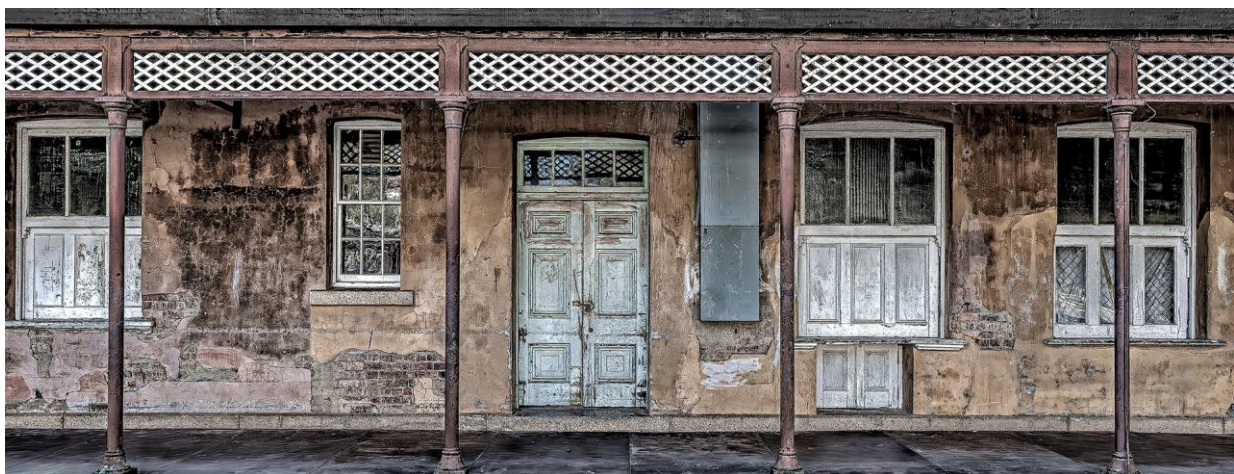
Abandon All Hope, Ye Who Enter Here.