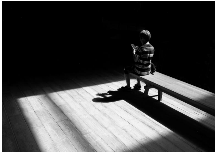
Who is calling? – Bill Chan DPI