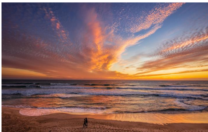
“Sunset Stroll” – Pam Rixon