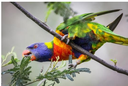
“Breakfast at a Stretch” Ean Caldwell