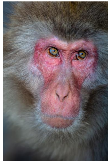
“Japanese Macaque Alpha Male”