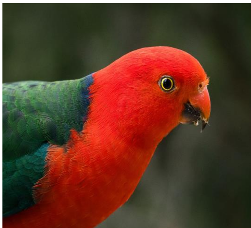
“King Red” – Liz Reen