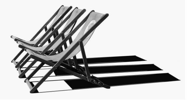
"Deckies" – Ean Calwell