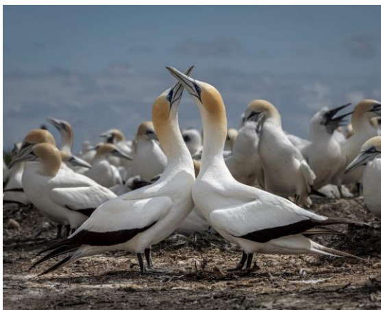
Ean Caldwell “Greetings”