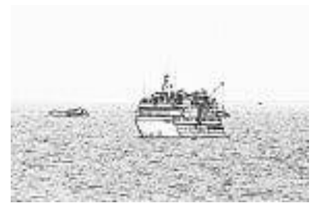
"All at Sea" - Beverly Dillon