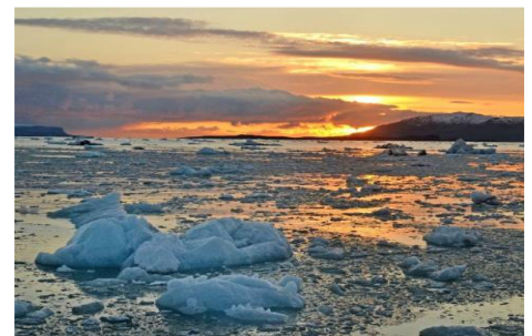
“Svalbard Evening” Beverly Dillon