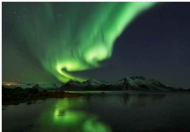
“Dancing Lights” – Pam Rixon