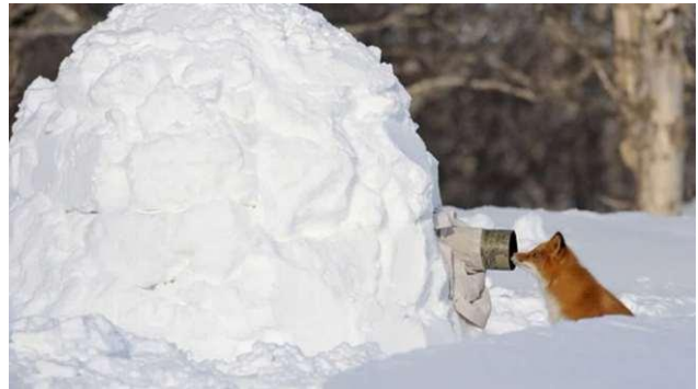
A couple of funny animal photos!!