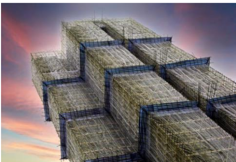
“Straw House” – Ean Caldwell