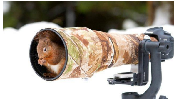
A couple of funny animal photos!!