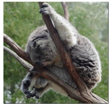
“Hanging Around” – Val Armstrong