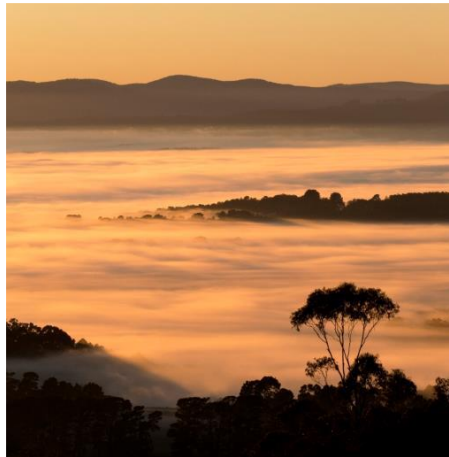
“Morning Break” – Bill Chan