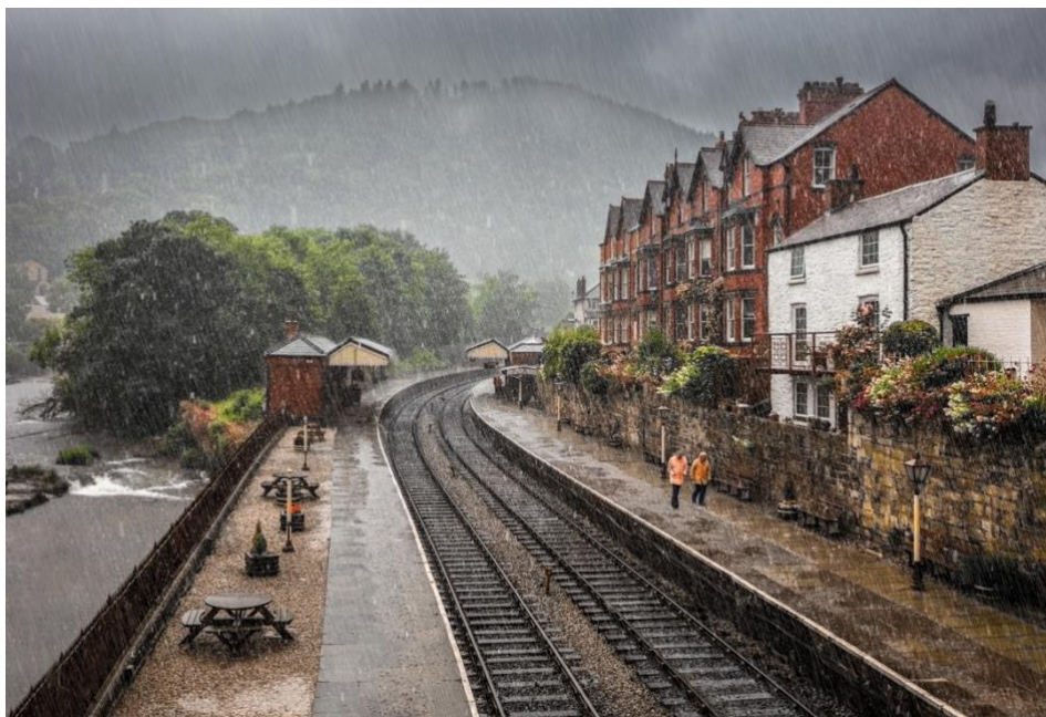
Heavy Rain At The Station 1 st place Open Print Pam Rixon