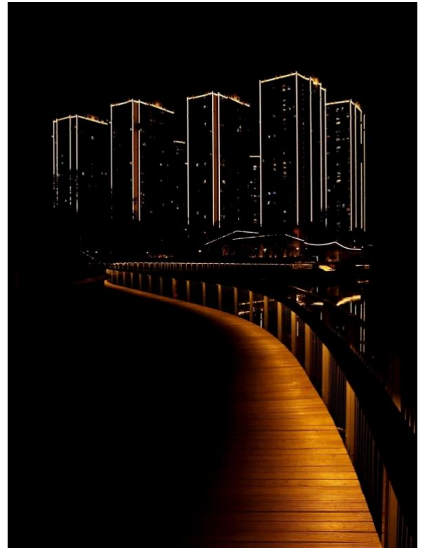
Night walk 3 rd place DPI Bill Chan