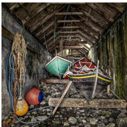
Old Boatshed 2 nd place Open Print Pam Rixon