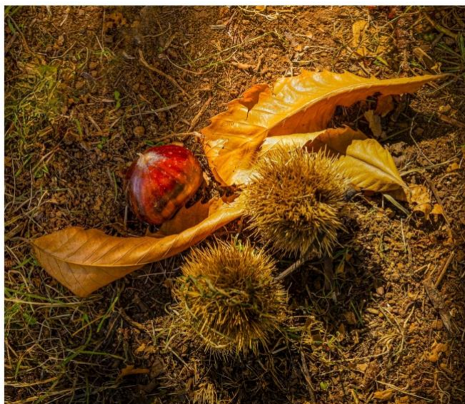
Chestnuts in the Wild!