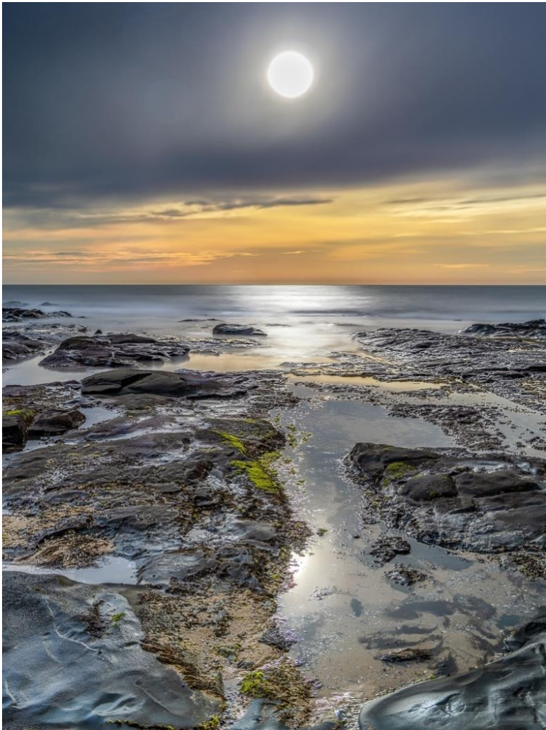
Morning Glow 2024 Land/Seascape Print of the Year Pam Rixon