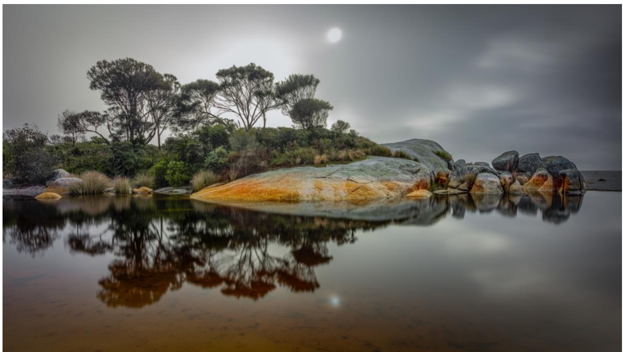
Swimcart Estuary 2024 Land/Seascape Digital Projected Image of the Year Pam Rixon