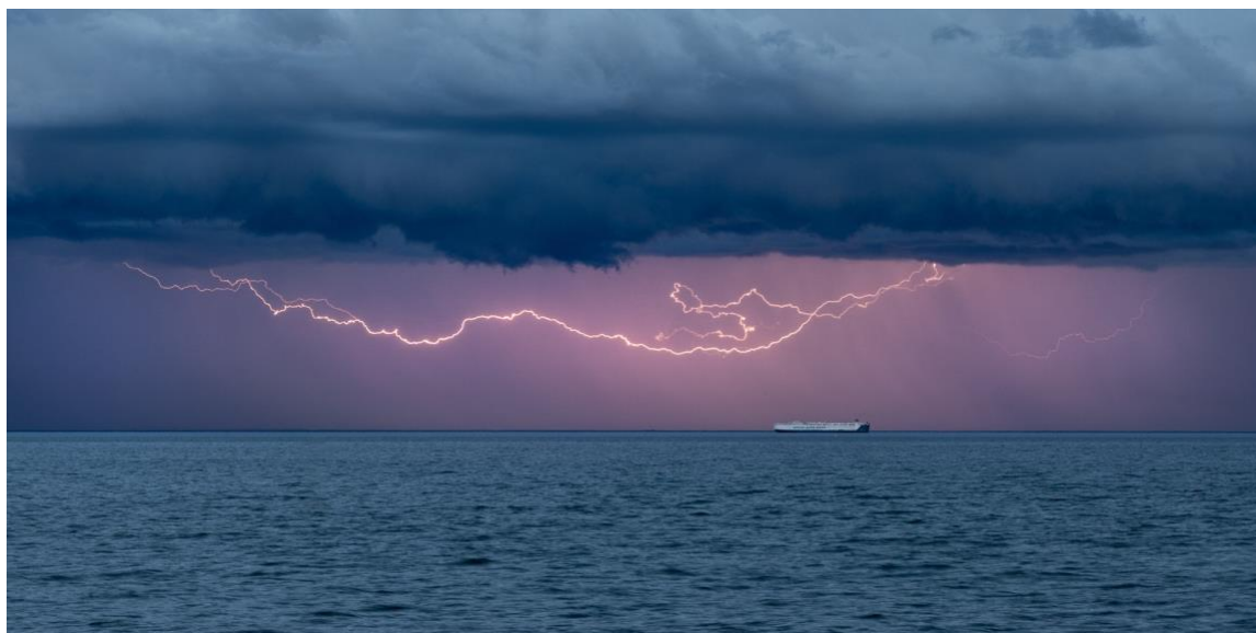
Layers Of the Storm 3 rd place Open Print Pam Rixon