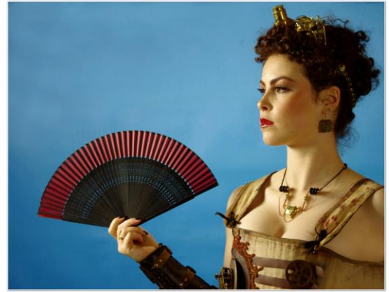
“Kierra” – Les Armstrong