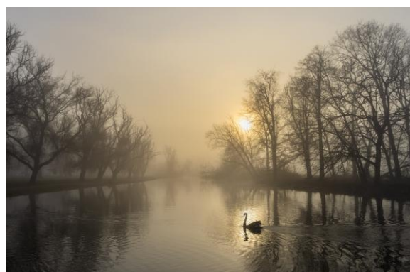
Early Morning Swim