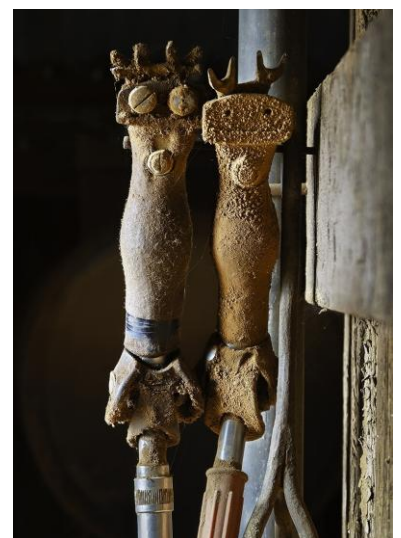
3 RD The Odd Couple