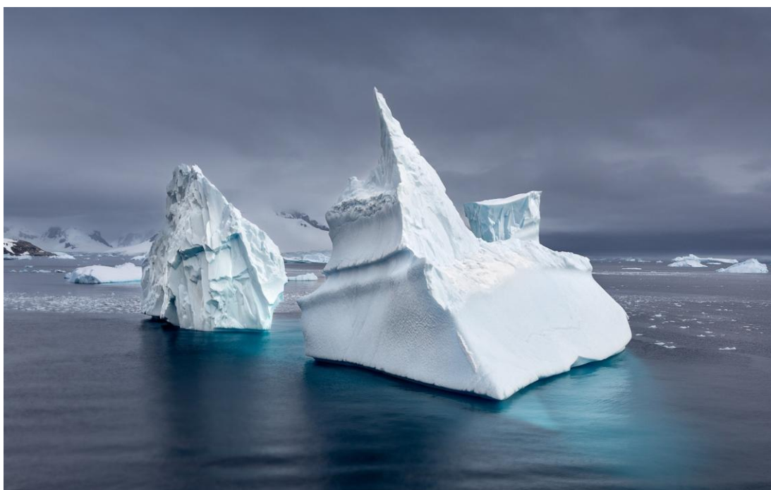
1 ST – Pointed Ice