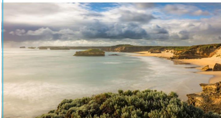
Bay of Martyrs