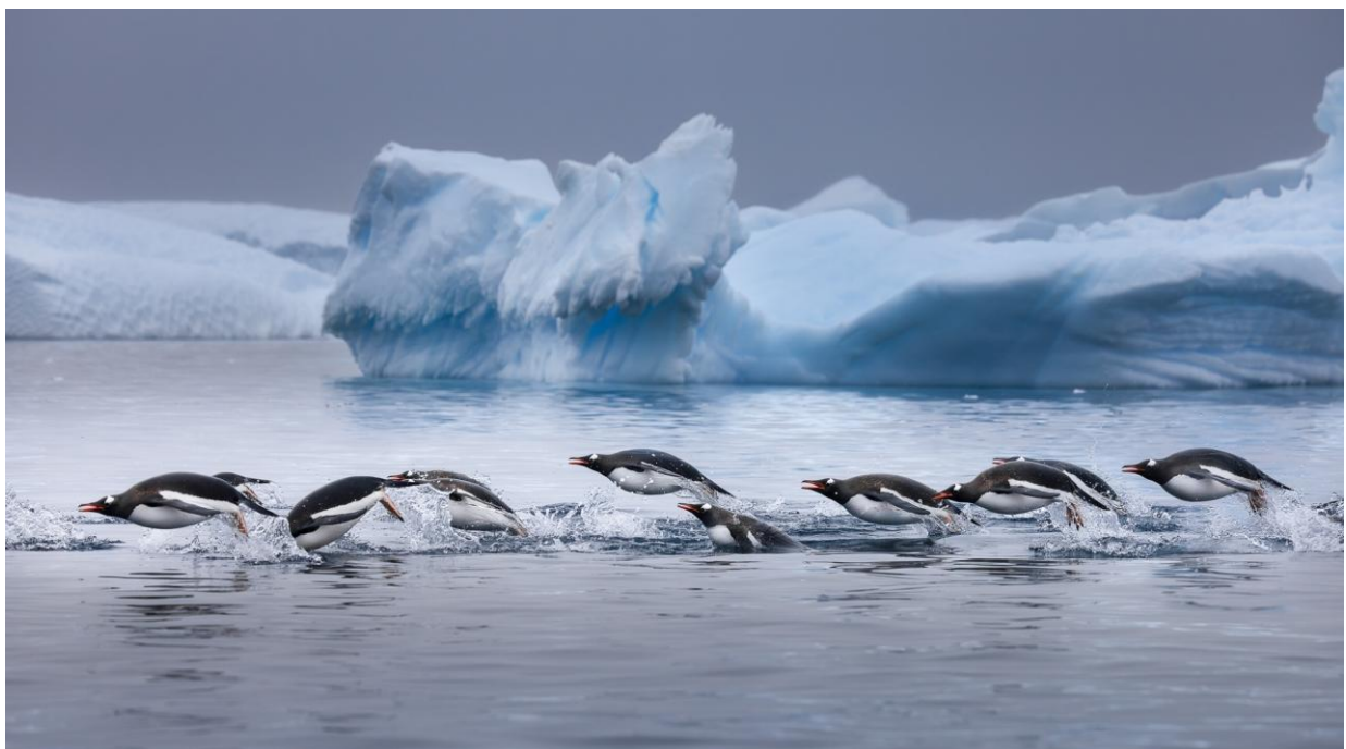
1 ST – Porpoising Dolphin