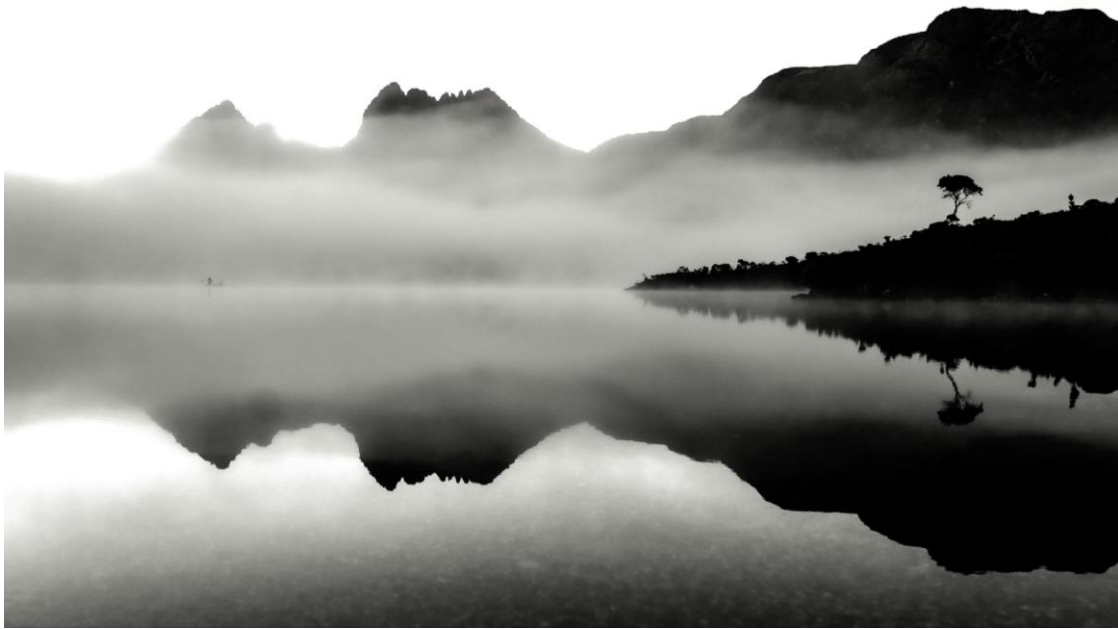
1 ST – Dawn Mist at Cradle Mountain