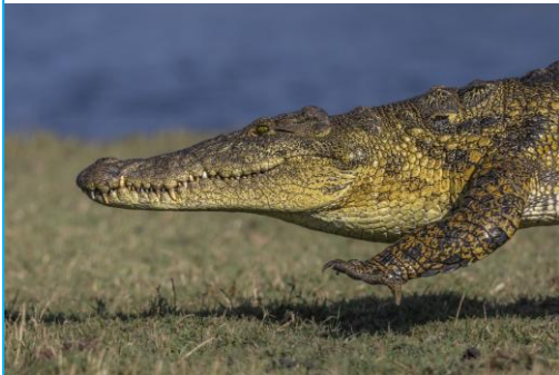
2 ND – On the Run