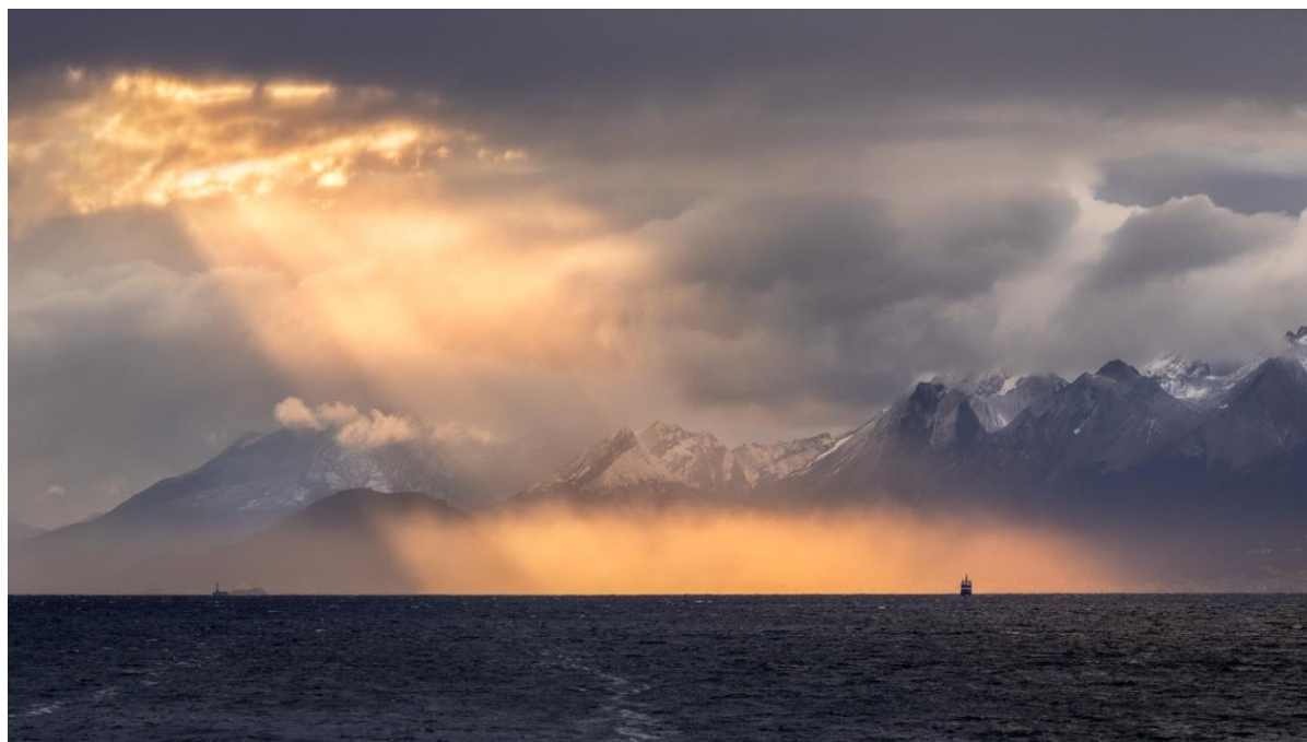
1 ST - Beagle Channel Sunset