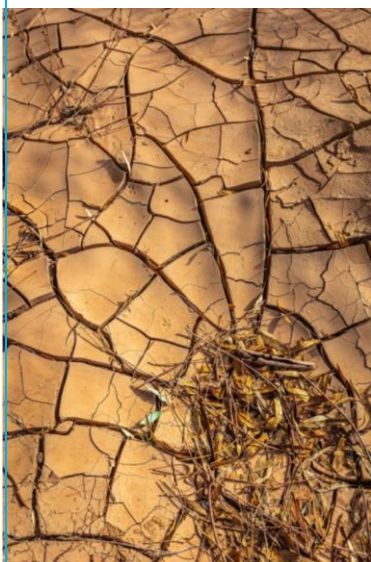
2 ND Baked Earth