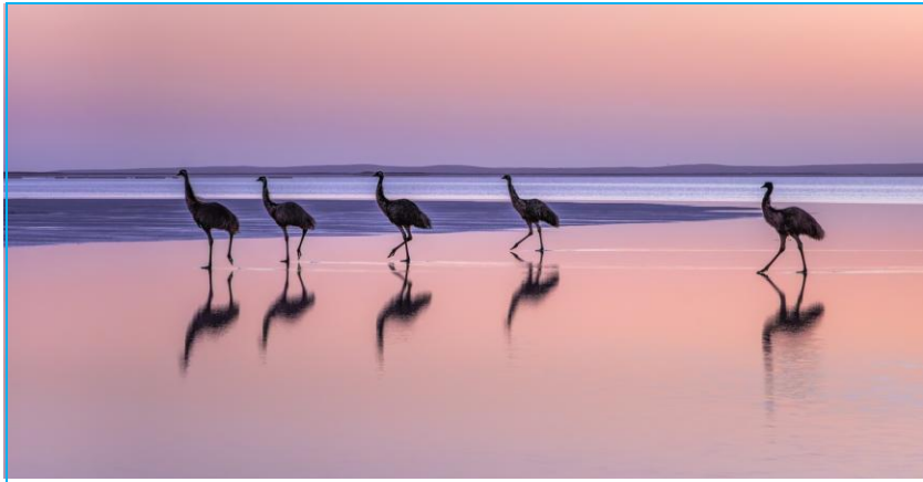
2 ND - Early Morning Walk