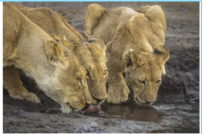
3 RD – A Watchful Drink