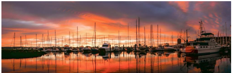
3 RD - Boats at the Bay