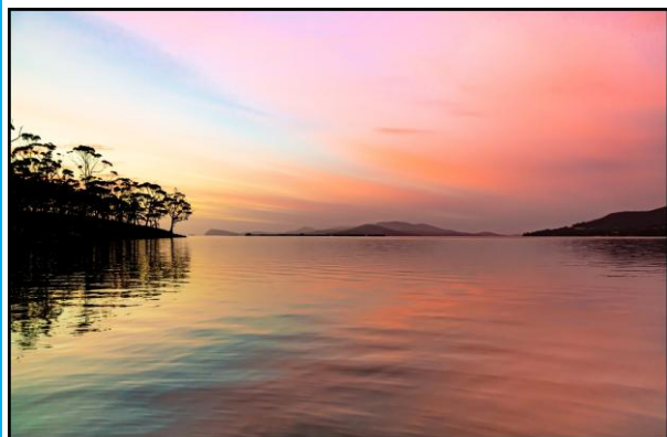
Evening Water Colours