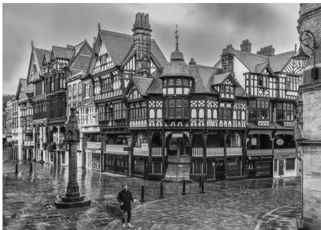
Raining In Chester – Pam Rixon