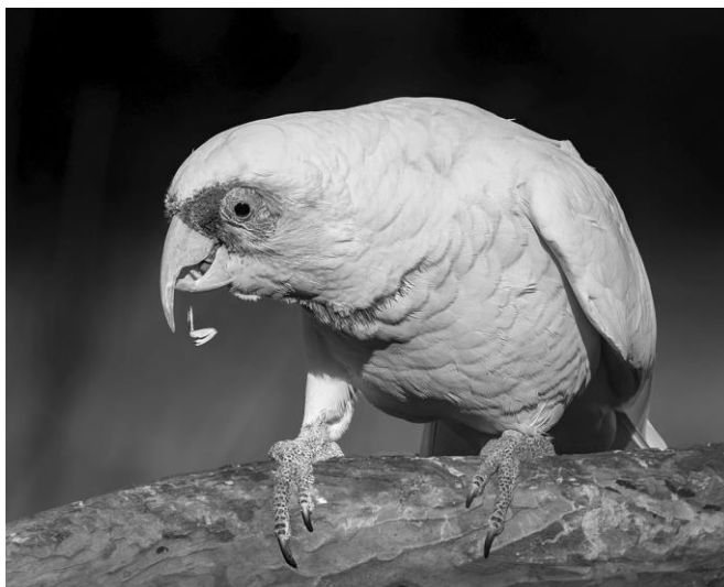
Ean Caldwell – Sunflower Seeds For Breakfast