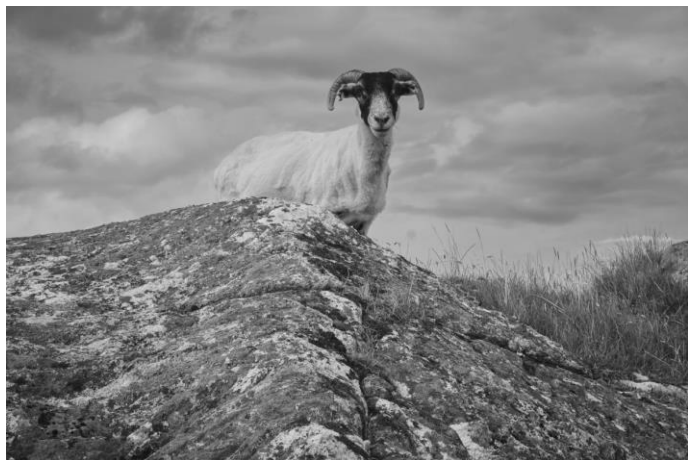
Highland Goat – Robbie Carter