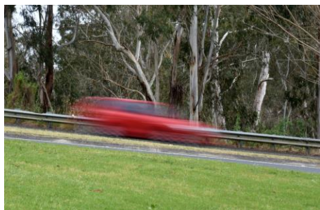
By Bev Dilan