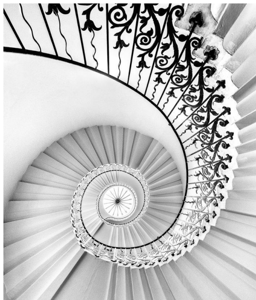
Pam Rixon - Spiral