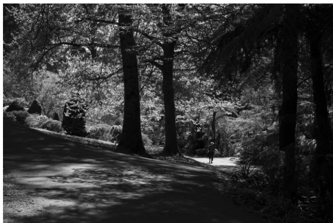
“ In The Forests” by Arthur Lilley