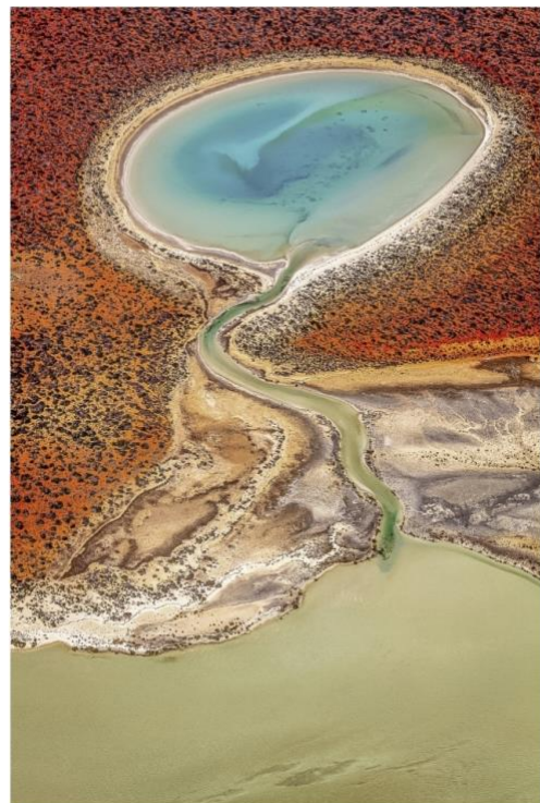
Blue Lagoon - 01