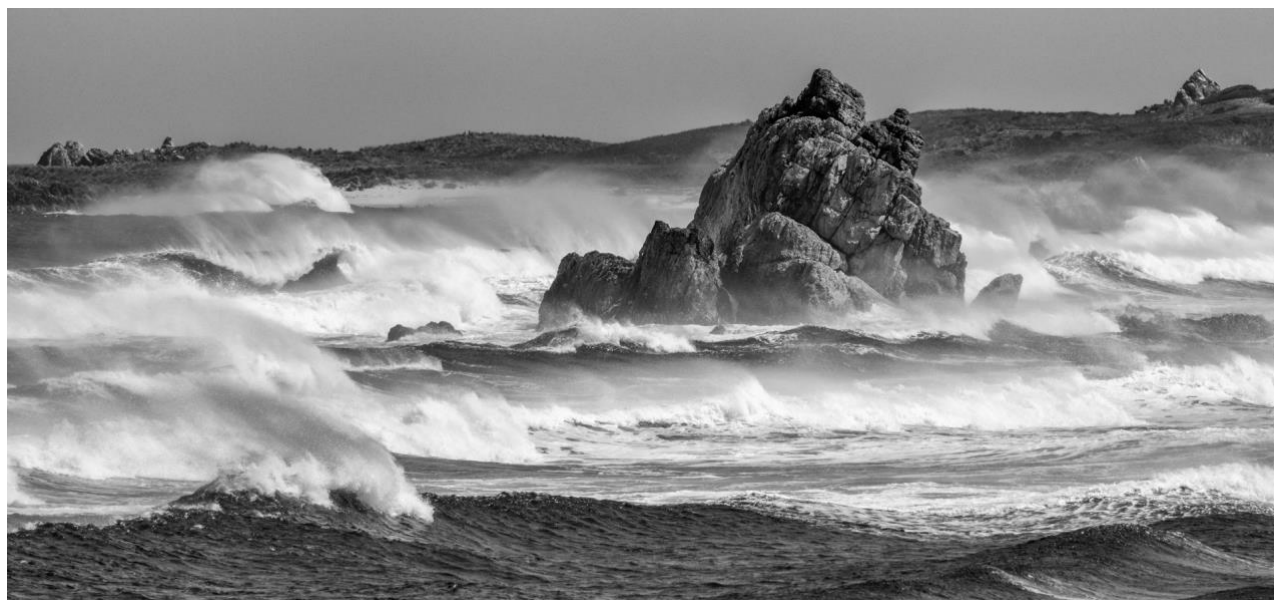
Pounding Cathedral Rock – Pam Rixon