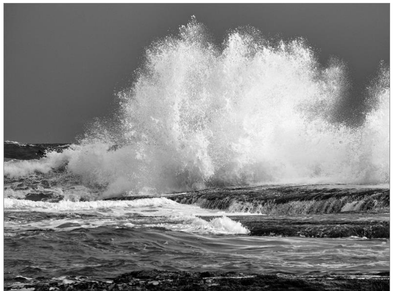
Wave Power – Ros Osborne