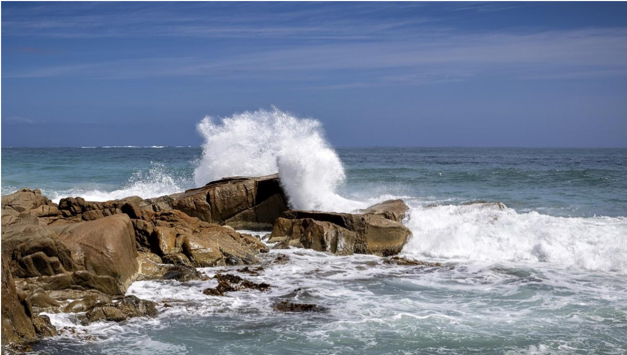
Splash – Ean Caldwell