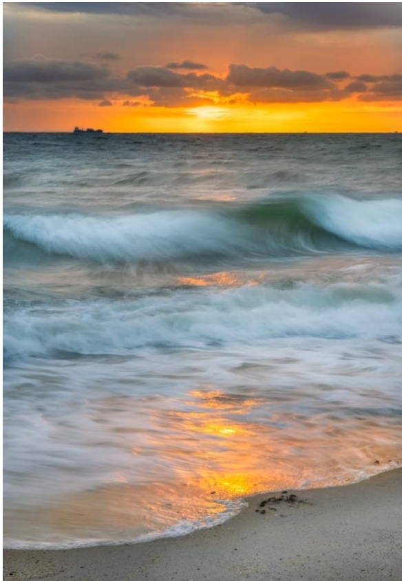
Black Rock Sunset – Pam Rixon