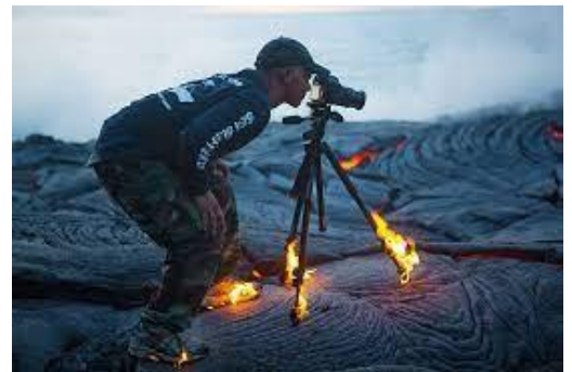
Some Photographers will go to any lengths!!

VAPS and VAPS Newsbrief - http://www.vaps.org.au/