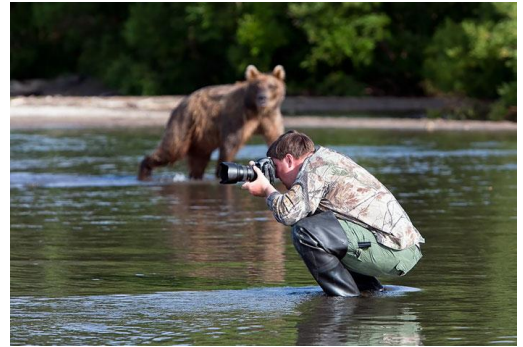
Some funny moments of dedicated photographers!!