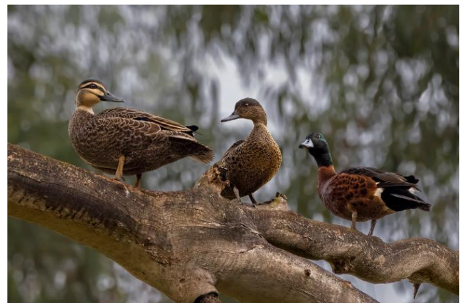
“Three Ducks in a Tree” – Ean Caldwell