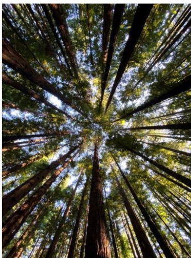
“Tall Trees” – Val Armstrong