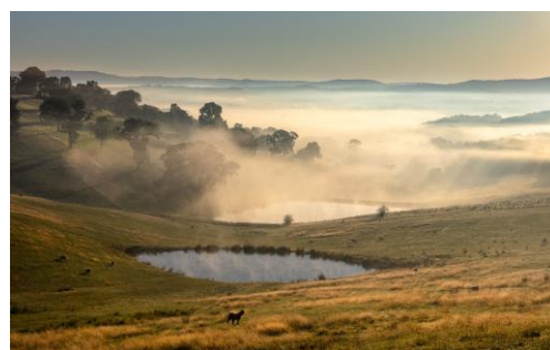
“Misty Morning” – Pam Rixon