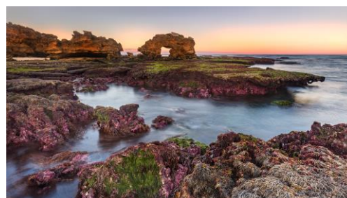
“Garden in the Sea” – Pam Rixon