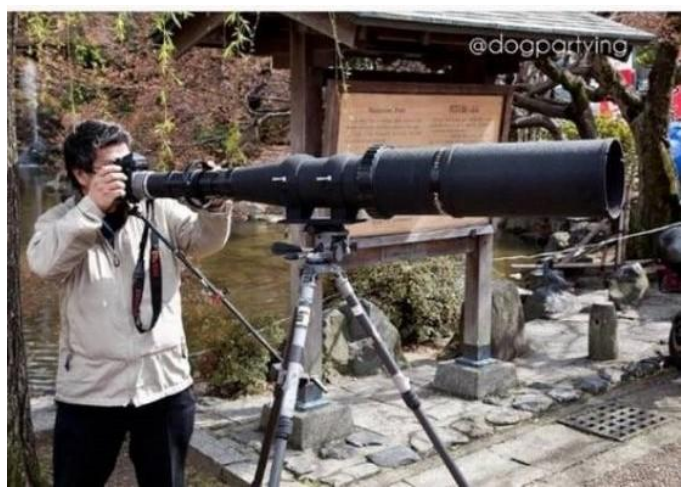
Then of course you could always walk around with this blunderbuss!!!

This is what you call two really keen photographers!!! Or, alternatively, more money than sense. Just to prove the Editor is not biased, one photographer is using Canon equipment, the other Nikon!