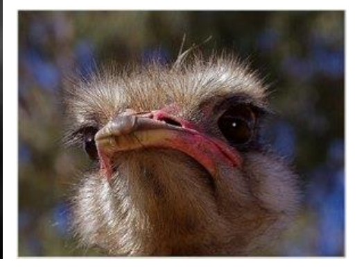
"Stuckup" – Les Armstrong