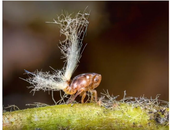
‘A fluffy Bum’ by Ros Osborne