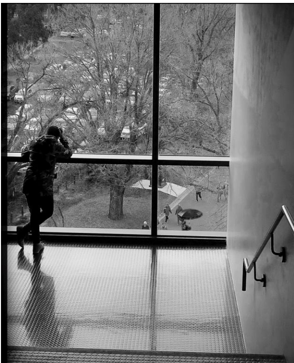
WATCHING AND WAITING – Don Stott