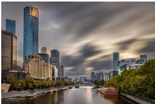
Pam Rixon “Yarra in Melbourne”