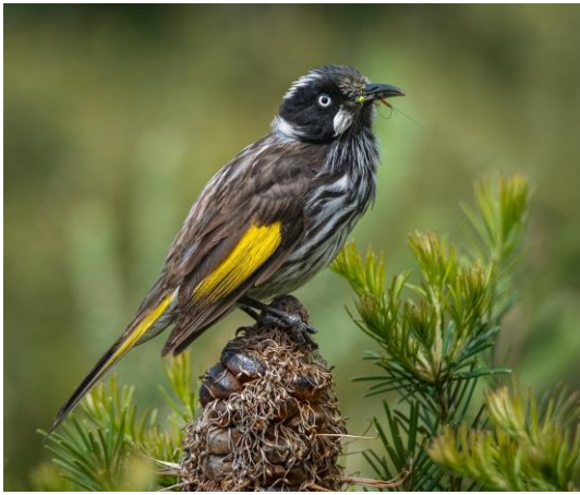
Pam Rixon “New Holland honey Eater”