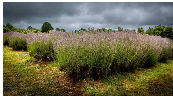
Cov Douvitsas “Lavender Farm”