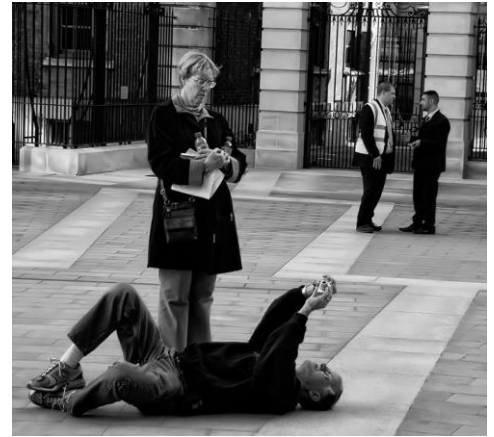
Some Photographers will go to any lengths!!

VAPS and VAPS Newsbrief - http://www.vaps.org.au/