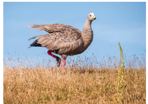
“Cape Baron Goose” – Pam Rixon