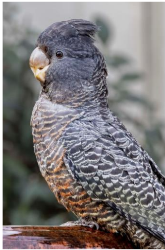
“Gang Gang” – Ean Caldwell