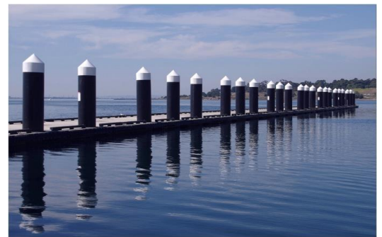
“Floating Pier” – Val Armstrong