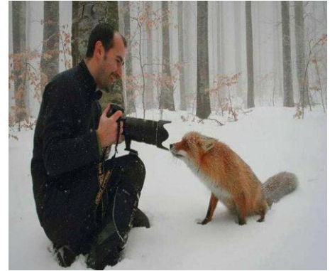
Some funny moments of dedicated photographers!!