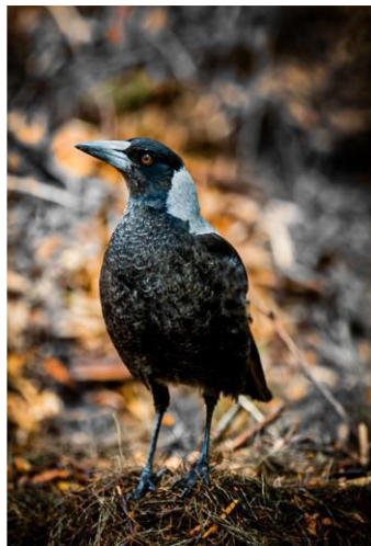
“Go the Pies” – Con Douvitsas