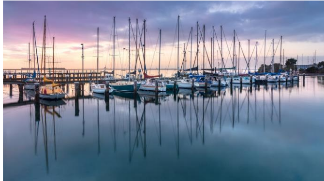
Second - "Silent Moorings" – Pam Rixon